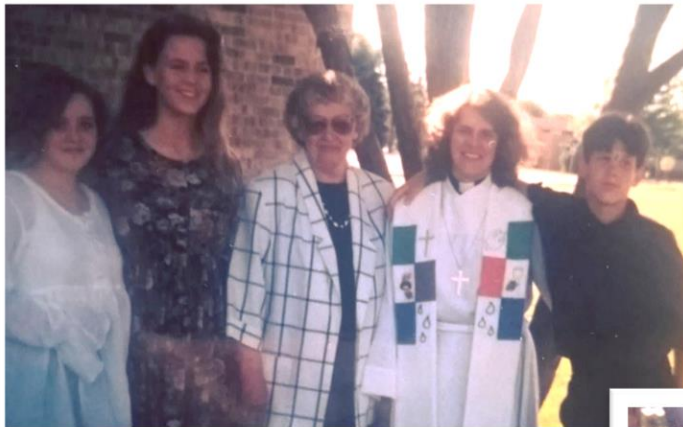
Ordination Day, June 5, 1994 - Lord of Life Lutheran Church, Waterloo, IA